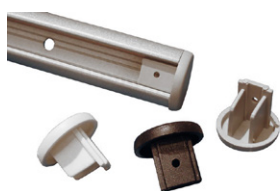
Track and caps

Mini Trac is a sturdy and a well-known 12V track system in the world of lighting. Its design and wide selection of accessories makes it an easy choice for flexible lighting.